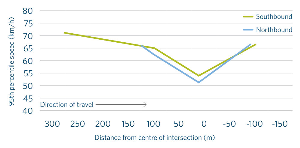
Figure 2: 95th percentile speeds on approach to, through, and departing intersection for northbound and southbound vehicles (mix of radar and tube measurements; 7-day data from 17-23 July 2019; negative distances denote intersection departure. Vehicles with less than a 3-second headway removed.)